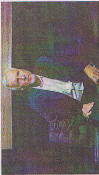
Director James Cameron at The Ivy Ballroom last night.

Cameron's Submersible was the winner of the Heavy Machinery category.